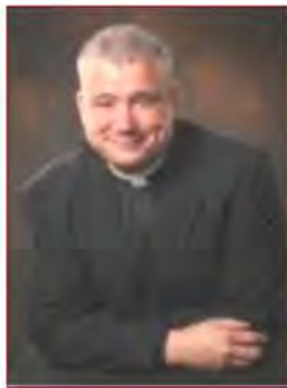
EWTN Radio Host, Author and Pastor from Erie, PA

Questions? Go to dioceseofvenice.org/respectlife .